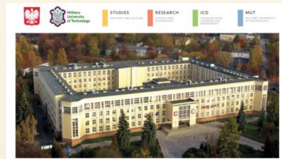
MUT Warsaw (PL)