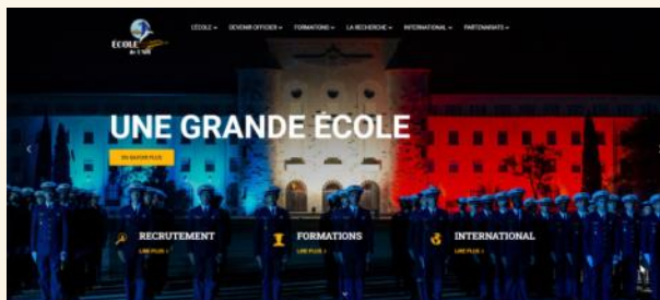
FAFA Salon de Provence (FR)