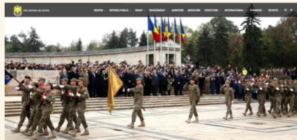
MTA Bucharest (RO)