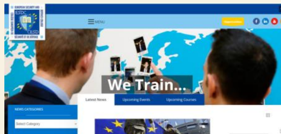
ESDC Brussels (EU)