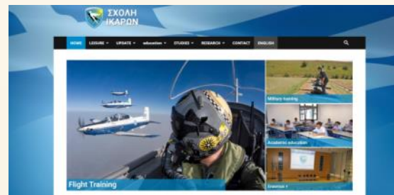
HAFA Athens (GR)